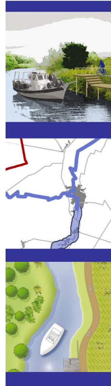
Strategic Cycling Routes