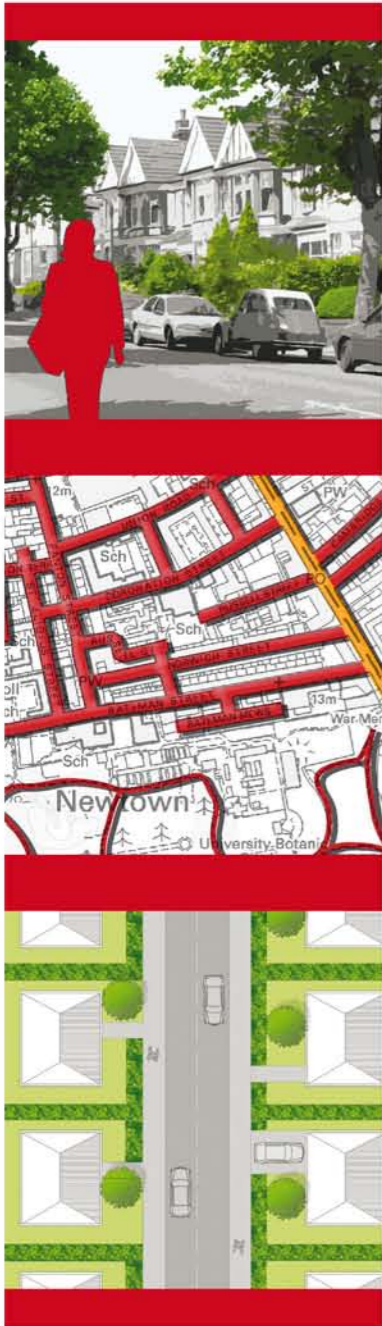
Local Community Connectors