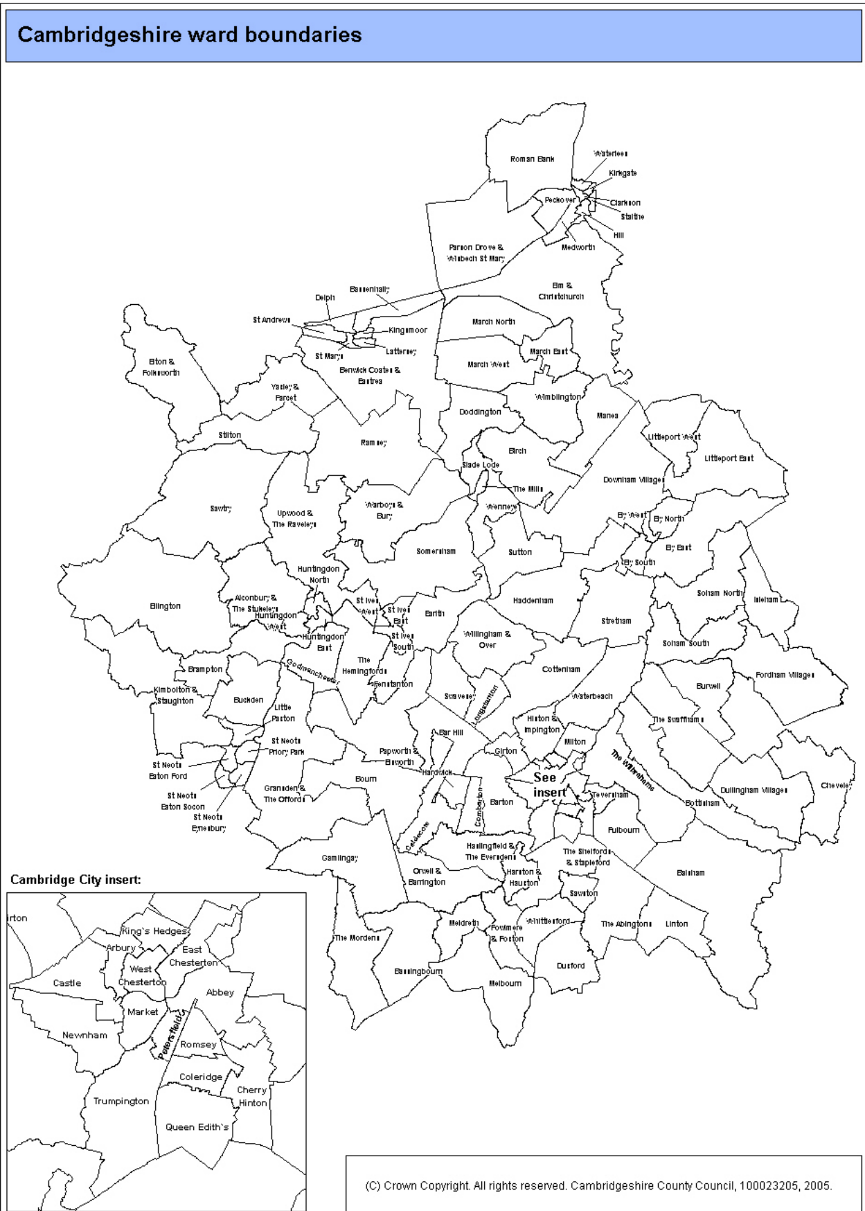
Map A1.1: Cambridgeshire ward boundaries